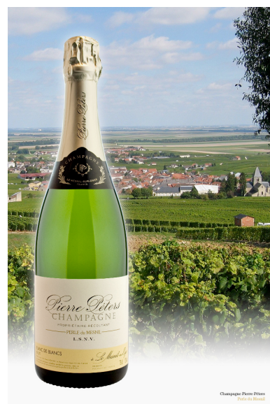
Perle du Mesnil