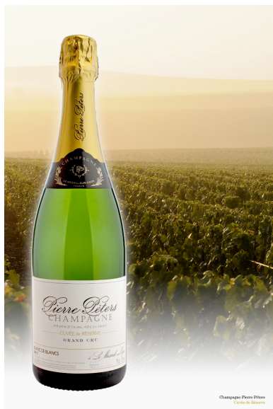
Cuvée de Réserve Blanc de Blancs - Grand Cru