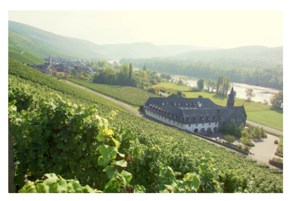
The famous south-facing and steep Josephshöfer Grand Cru vineyard along the Mosel River