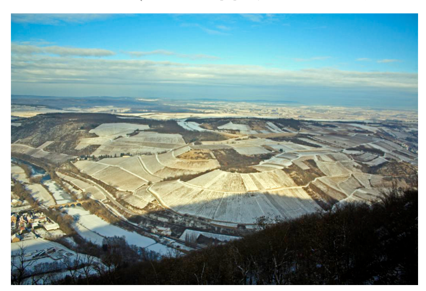
The world famous Niederhauser Hermannshöhle Grand Cru vineyard – a top reference site for German Rieslings